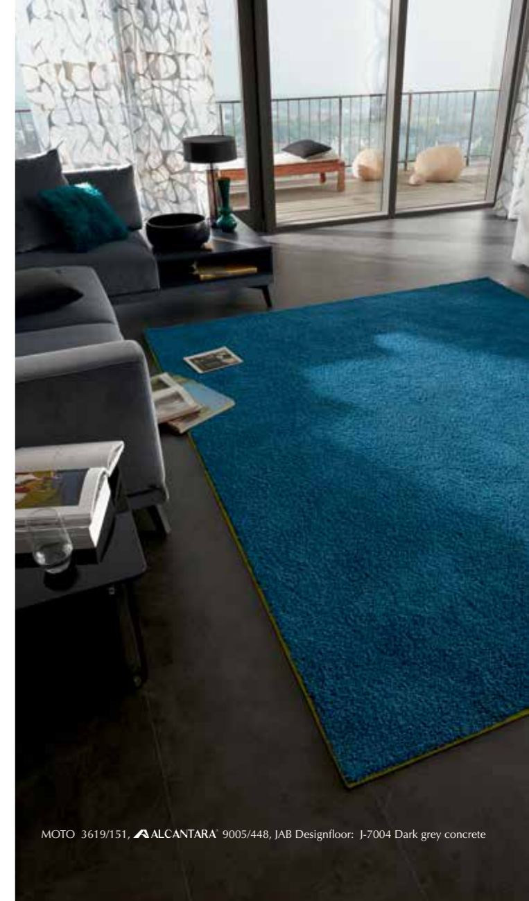
MOTO 3619/151, ALCANTARA® 9005/448, JAB Designfloor: J-7004 Dark grey concrete