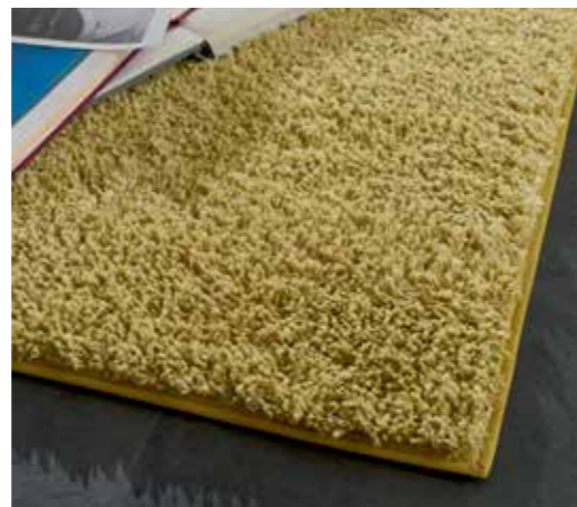
TWIN 3622/044, ALCANTARA® 9005/448