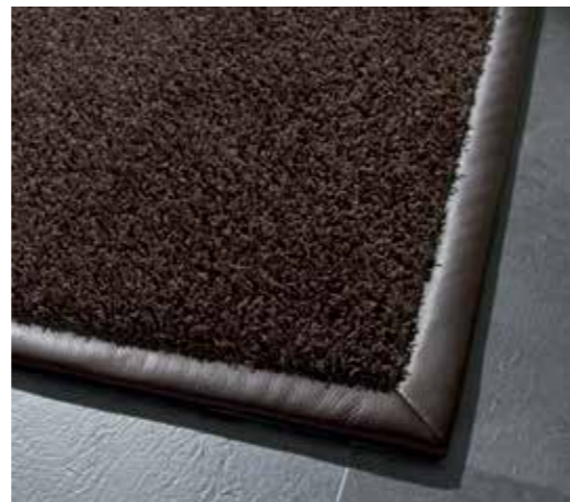
MOTO 3619/726, LEADER 9009/244