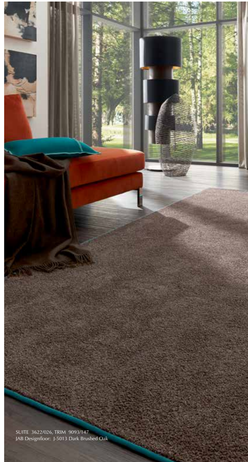
SUITE 3622/026, TRIM 9093/147 JAB Designfloor: J-5013 Dark Brushed Oak