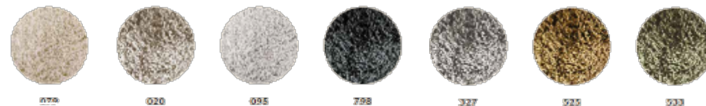
Article No. Colours