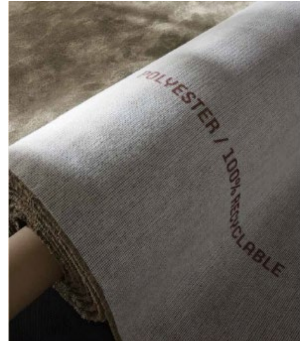
For technical reasons, the lettering is printed continuously about one metre from the edge of the fabric.